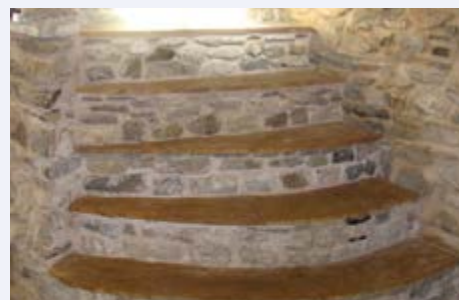
Fig 3 - Resilient (and very attractive) steps to upstairs flat (replaced standard wooden staircase)