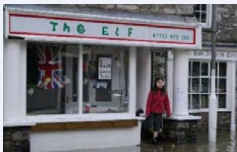
Fig 1 Shop frontage during 2015 flooding

The shop is on a busy road, and cars continued to drive through the floodwaters, sending additional waves into the building. As the location is at a low point within the town, the owners knew there was no point trying to exclude water, particularly as they expect more intense rainstorms owing to climate changes. To combat this problem, the owners first built a low wall (using sympathetic local materials) in front of their premises, to help deflect the water from passing vehicles (Figs 1 and 2).