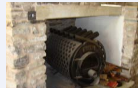
Fig 4 Wood-burning stove, housed within body of stone staircase (German 18kw design)

As this is a listed building, the repair process raised some additional challenges – however, the alterations made were carefully chosen to complement the style of the building and is an illustration of what can be done with ingenuity!