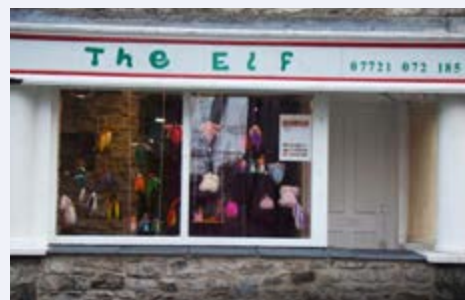
Fig 2 Low stone wall to deflect 'bow-waves' from passing vehicles in any future floods