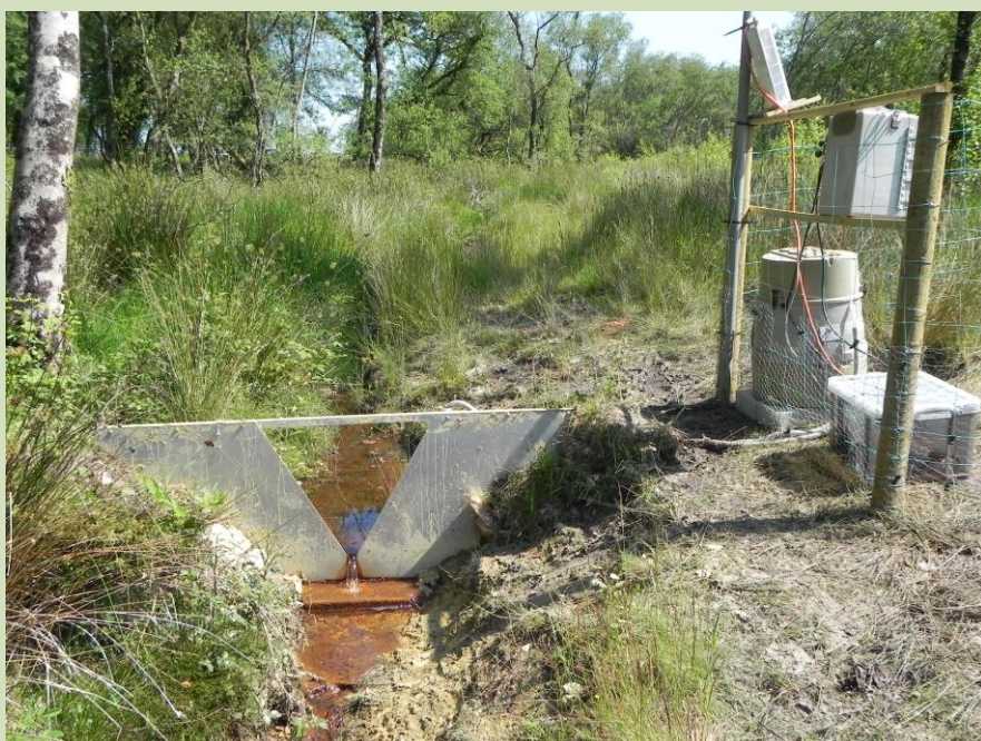
Photo 2: Experimental 'V' notch design for hydrological measurements at the west Devon enclosure

Information monitoring at the enclosed site in west Devon is given on the project's dedicated web pages on the Devon Wildlife Trust's website ( www.devonwildlifetrust.org/devon-beaver-project ). Some of the equipment used for hydrological measurements at the site is shown in Photo 2.