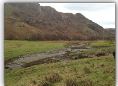
Figure 3 Swindale Beck 2 months after completion of restoration.

Naturalising a previously straightened, diverted or realigned river in rural landscapes returns the flow diversity , encouraging creation of natural features, habitats and biodiversity . It can also slow the flow in upstream reaches, aiding NFM and reducing downstream flood risk. One example is on Swindale Beck in Cumbria where the natural channel was reinstated and remeandered (Figure 3).