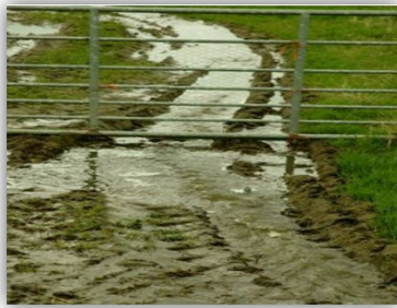
Figure 2 Farm tracks and poorly maintained access points create direct runoff.