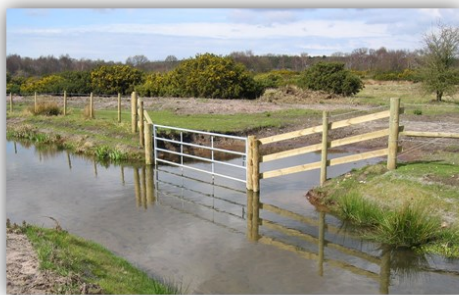
Figure 6 Fencing to avoid bank poaching by livestock.

An example of a larger scale approach is the Pontbren Project in Wales, which uses woodland, hedges and tree planting to enhance farming activities. Set up by a group of farmers, this project has improved wildlife and reduced runoff as well as helped the farm business. This initiative uses many techniques and demonstrates the impact of effective collaboration and cooperation of stakeholders.