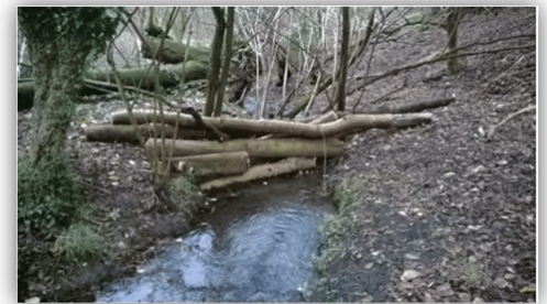
Figure 4 Example of a leaky dam on the River Frome, Stroud.

Examples of RSuDS include leaky dams (Figure 4) to reduce flow velocity and offer habitat diversity , and floodplain ponds for sediment and flood water storage . These techniques are still being established in rural areas but could greatly improve catchment water management by adapting practices to facilitate more intense, frequent rainfall predicted due to climate change.