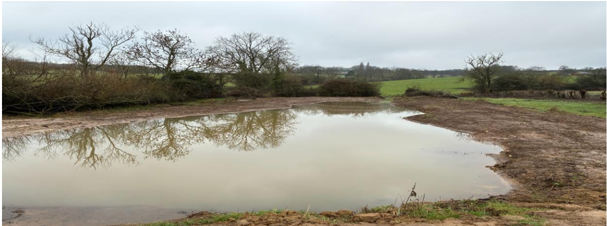
Picture above-large off-line pond.