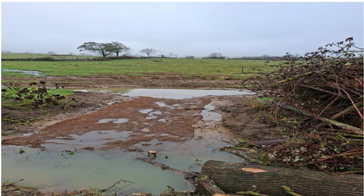
Picture above-the use of netting (not seen before) to protect the ground surface from soil erosion. The channel leads to an off-line pond and wetland.