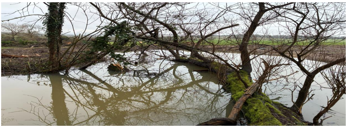
Picture above-large desilted in-line pond.